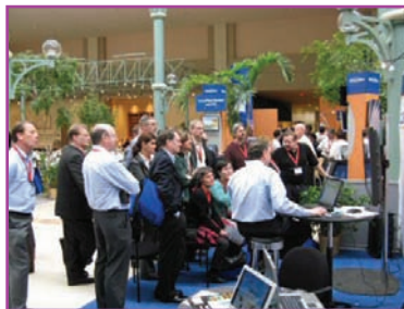
Figure 1. C2Share was launched a year ago at the 2007 DaratechPLANT conference in Houston.